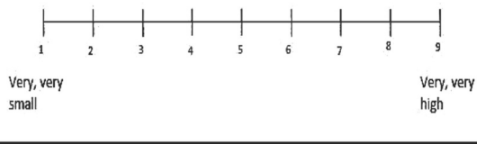
Figure 2 Cognitive load rating tool by Paas and Van Merriënboer—using the rating scale, please rate the amount of mental effort that was required to complete this simulation scenario.

asked to rate their cognitive load after the completion of the simulation scenario (figure 2).