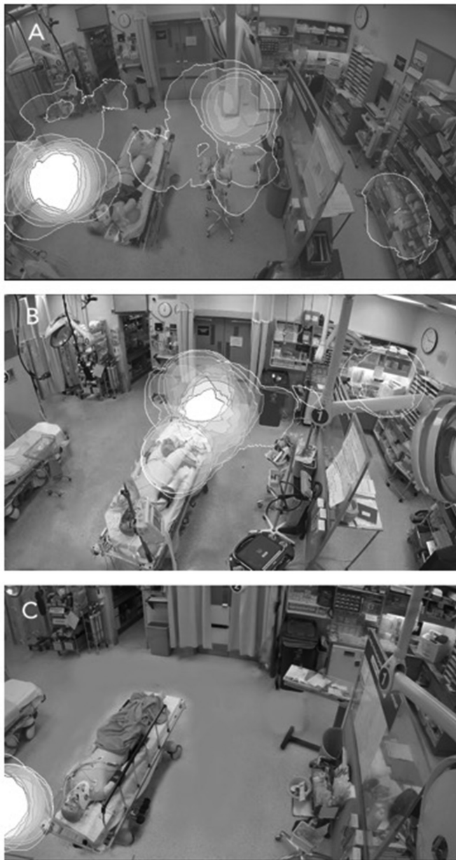
Figure 2 Heat maps. Visual representation of high frequency and low frequency of clinician location during session 1 (A), session 2 (B) and session 3 (C). High-frequency location is denoted by greater white colour opacity while lower-frequency locations are nearly transparent.

each performing a cricothyroidotomy. Qualitative and quantitative analysis demonstrated differences in workflow, movement and space used between each clinician. Human movement and ergonomic analysis are important human factors during resuscitations and inefficiencies in these elements may negatively impact patient outcomes particularly when critical, life-saving interventions are delayed. While traditional video review may be sufficient to appreciate overall team performance and generalised team movement, there are considerable distractions and competing activities when observing 8–10 individuals work within a busy resuscitation environment. A tracing tool that specifically isolates the movement of selected individuals mitigates distractions for the viewer and provides both visual and quantitative metrics that can be considered in conjunction with the sequence of significant events captured during a simulated resuscitation.